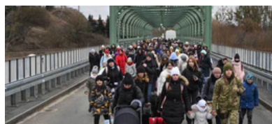
The EBRD and the war on Ukraine